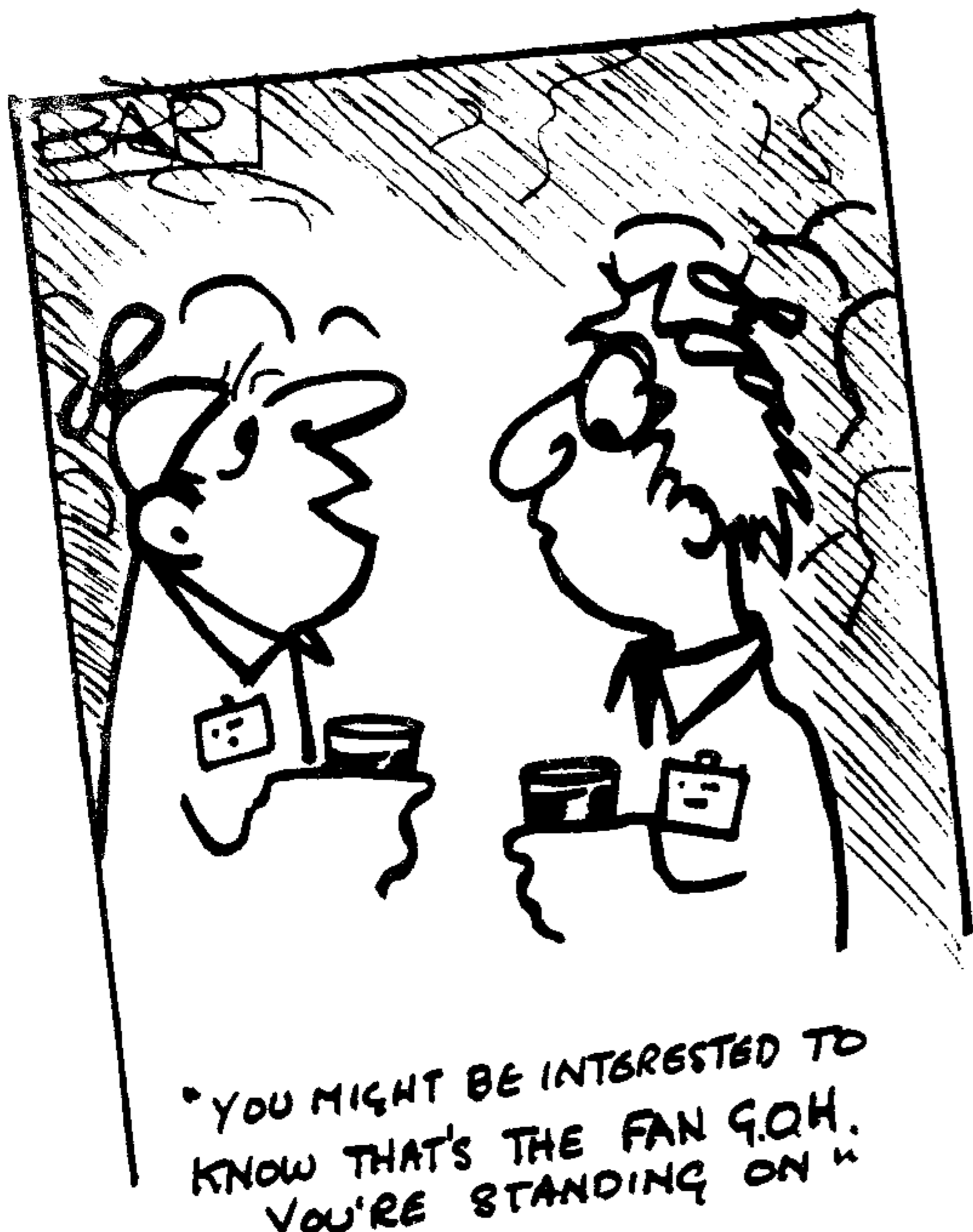
"YOU MIGHT BE INTERESTED TO KNOW THAT'S THE FAN G.O.H. YOU'RE STANDING ON"