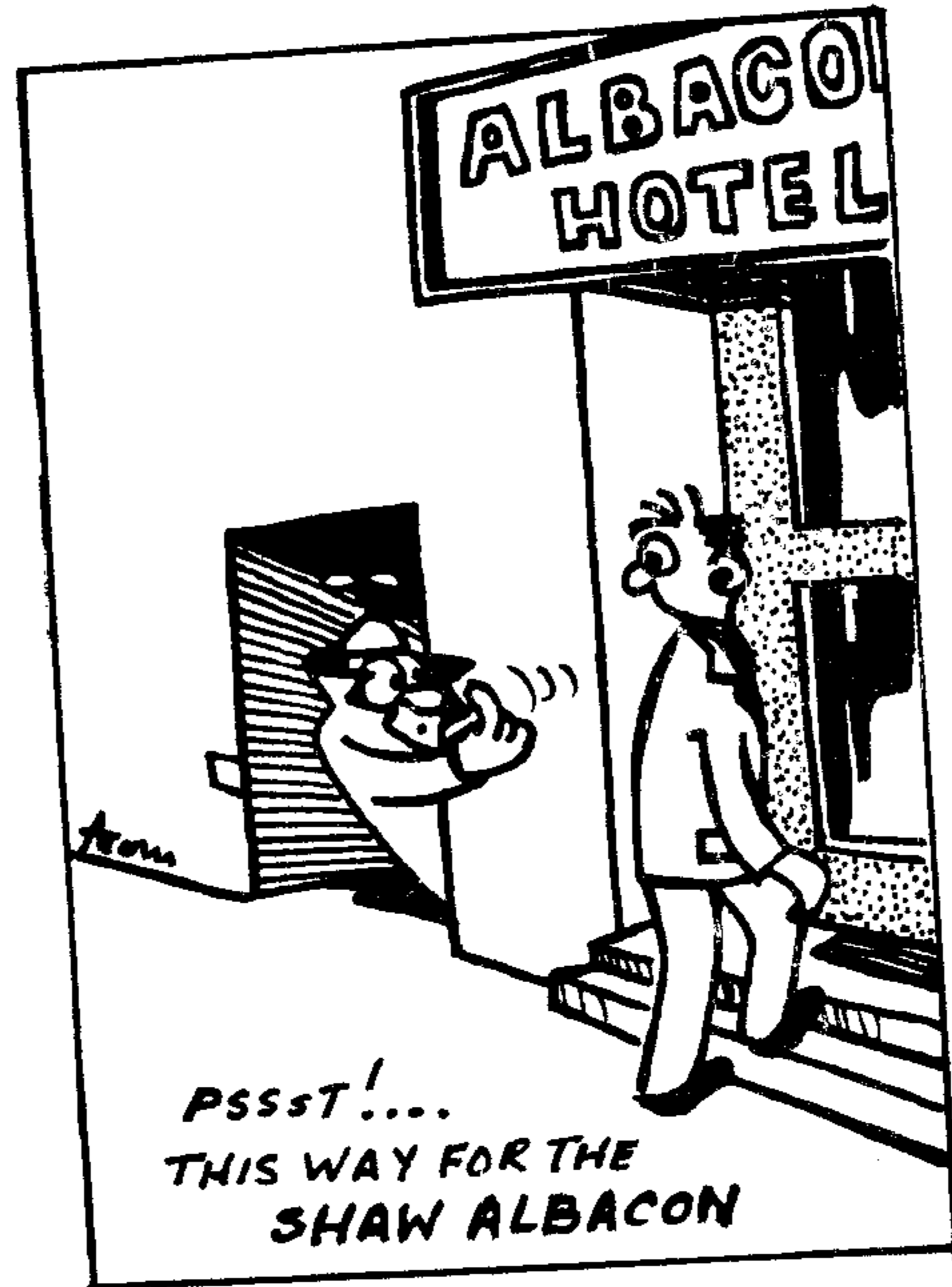
PSSST!... THIS WAY FOR THE SHAW ALBACON