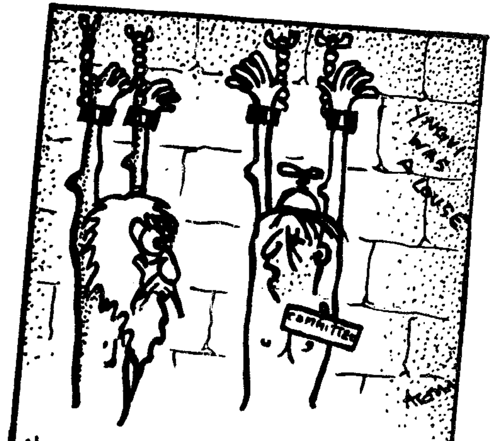
"THEY SAID, IGNORE HIS SOLICITORS LETTERS ... THEN ONE NIGHT....."