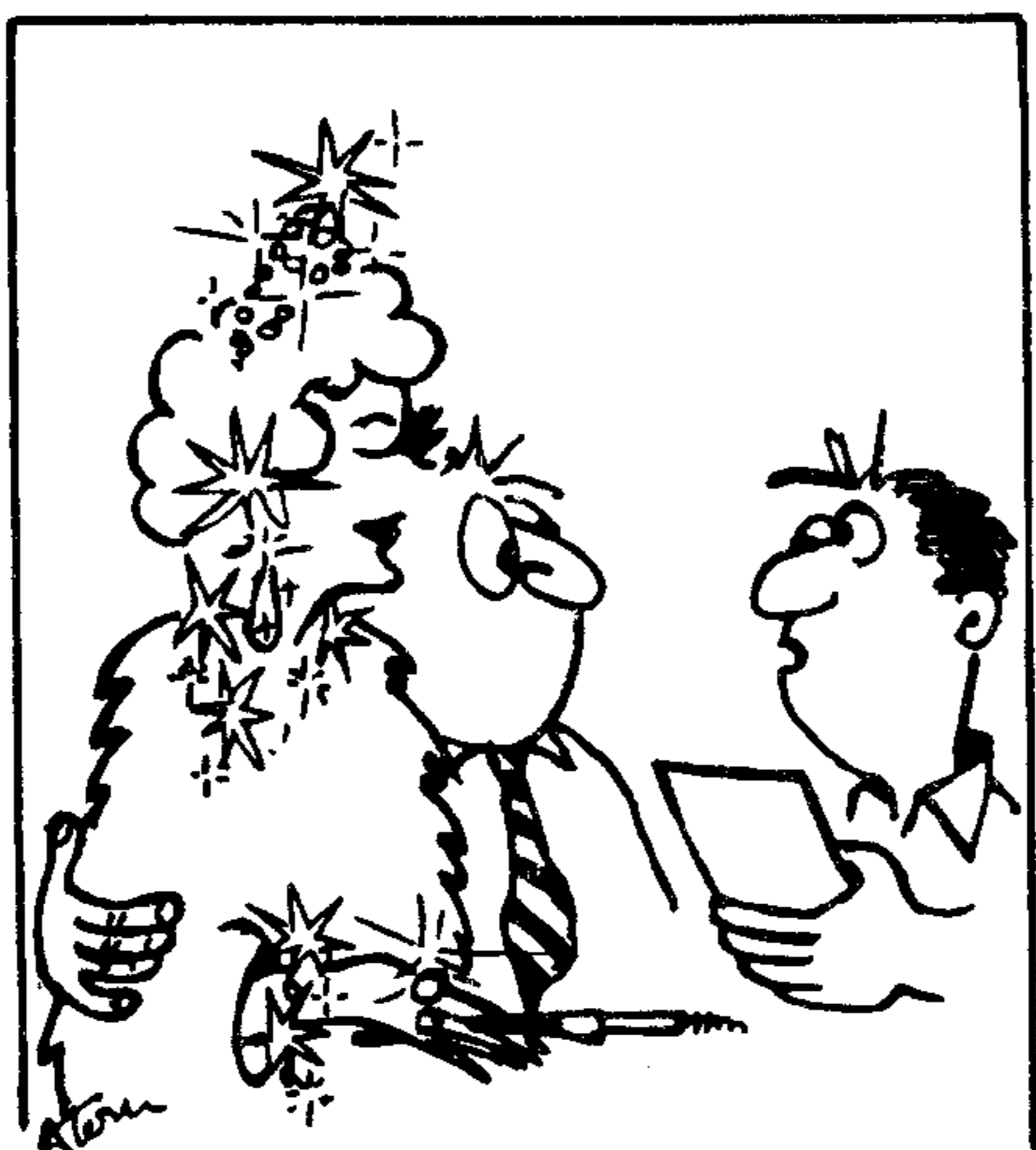
IT'S FROM LANGFORD, WANTS TO KNOW IF WE MADE ANY PROFIT ON THE CON.