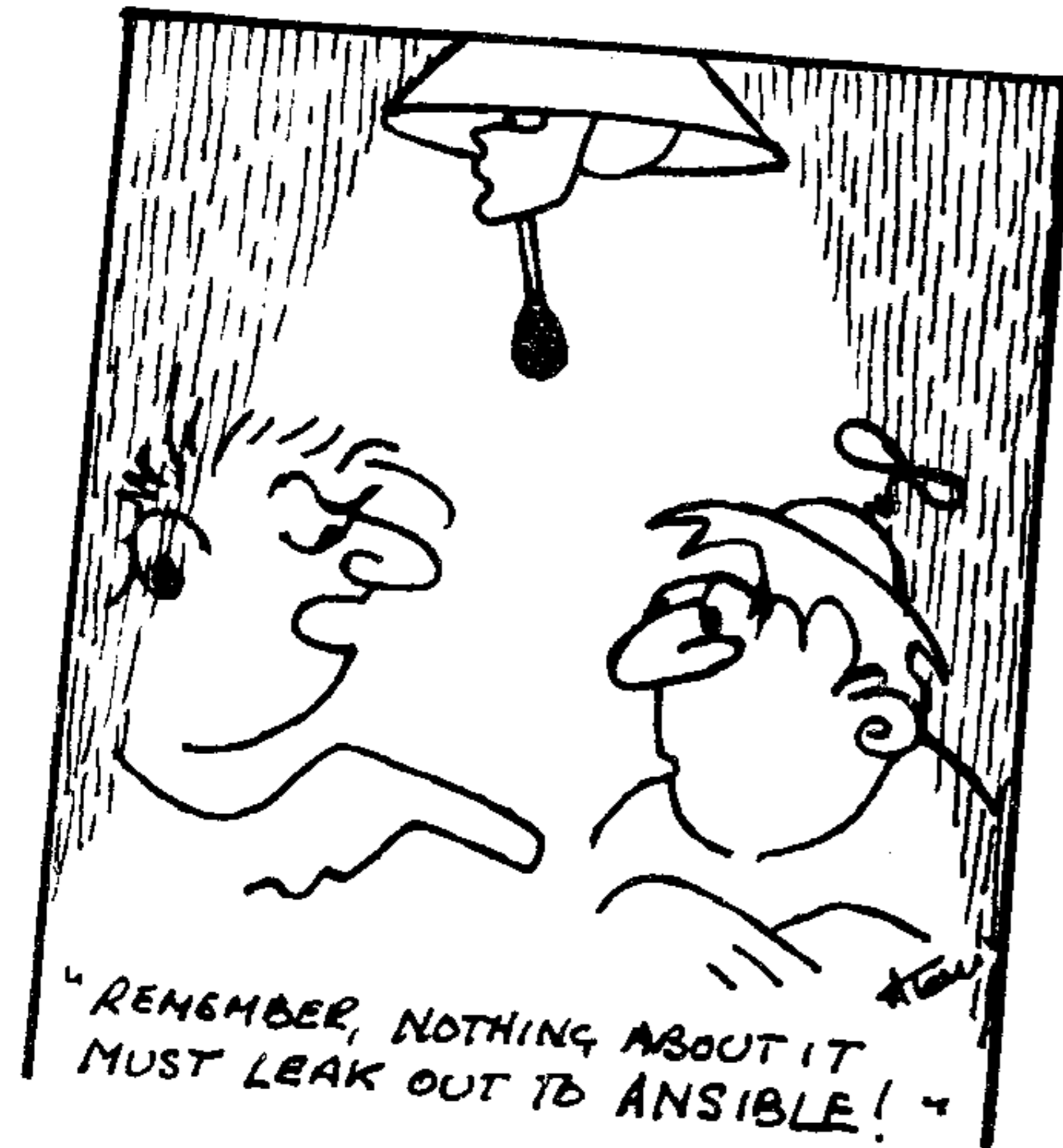
"REMEMBER, NOTHING ABOUT IT MUST LEAK OUT TO ANSIBLE!"