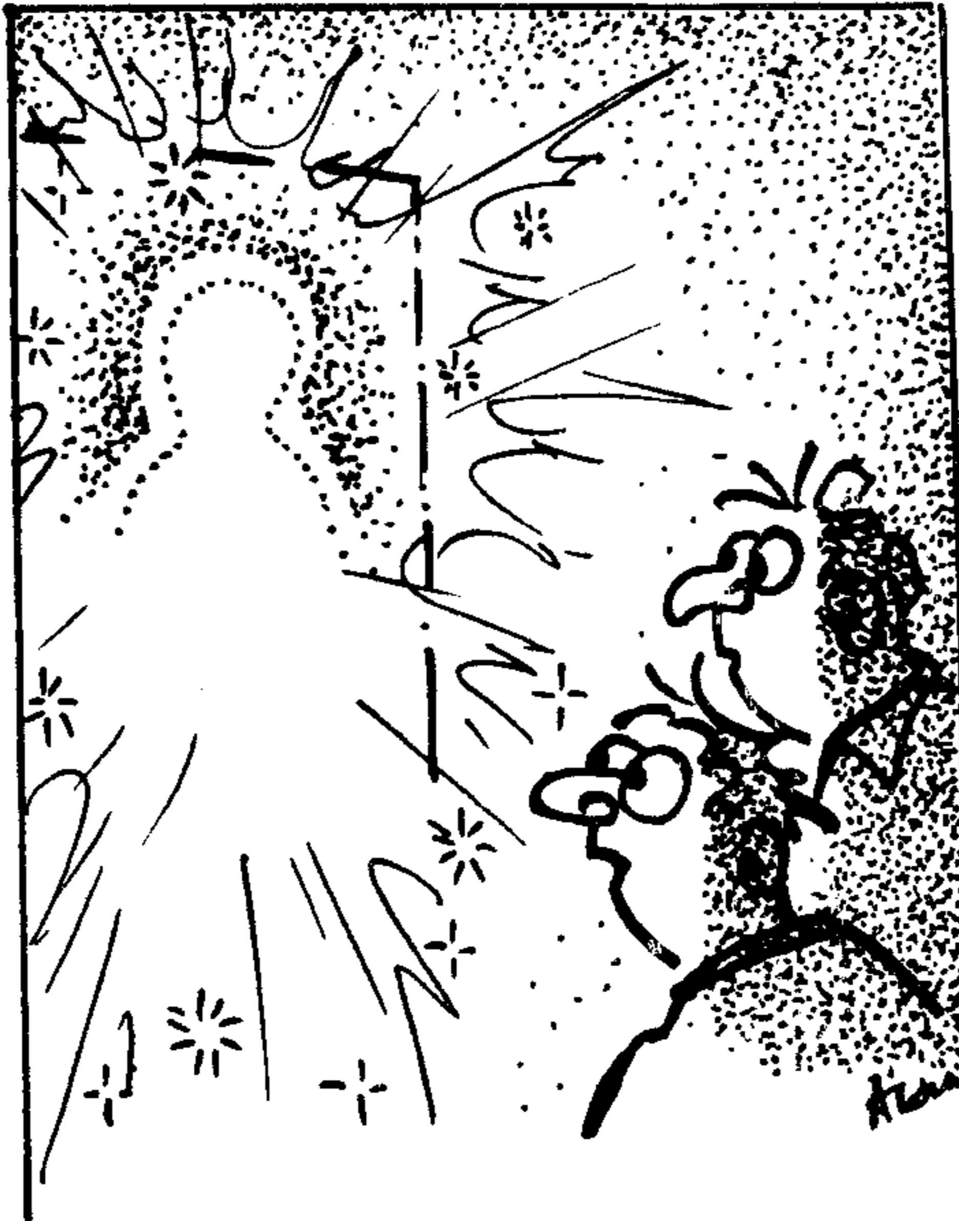
"HE'S BEEN MAKING THESE ENTRANCES EVER SINCE HE GOT THE GOLLANZ JOB"